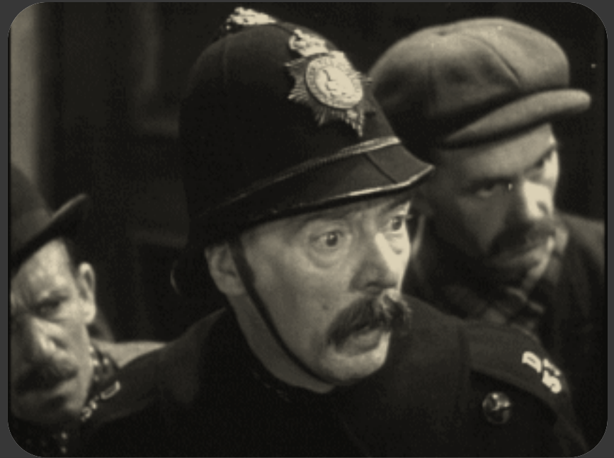
E.E. Clive as the bewildered Constable Jaffers