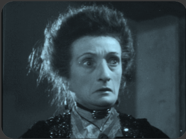
Una O'Connor as the very annoying Mrs. Hall