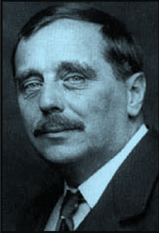
H.G. WELLS, AUTHOR OF THE NOVEL