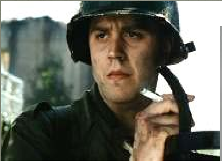
Jeremy Davies as Cpl. Timothy Upham, the Translator