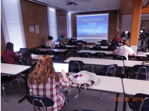
Quiet study in the library

We continue to try to balance student needs for activity locations vs quiet study. As evidenced by more than 20,000 individual sign-ins and 849 classes, this is not a simple matter.