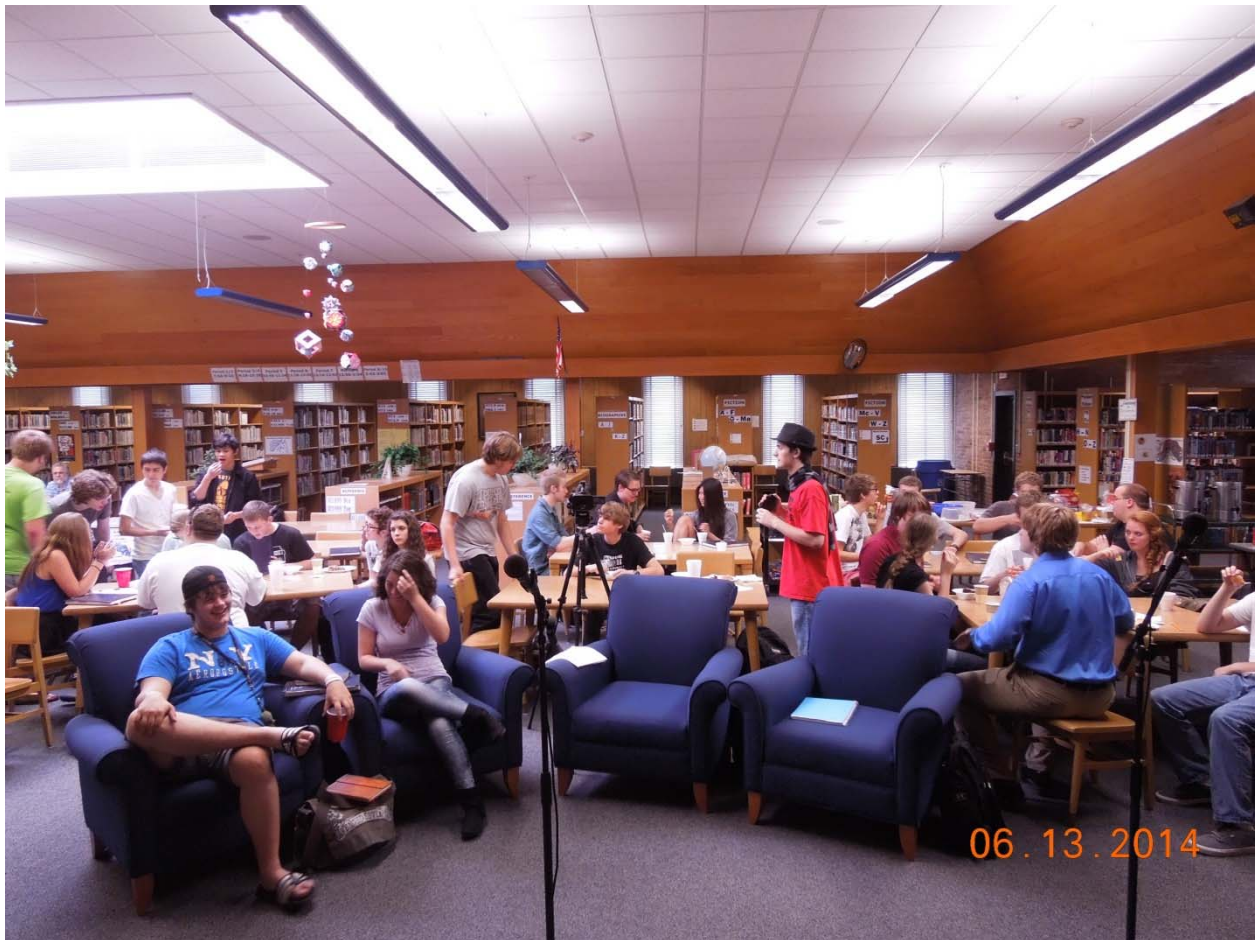
End-of-year Wider Arts Society gathering