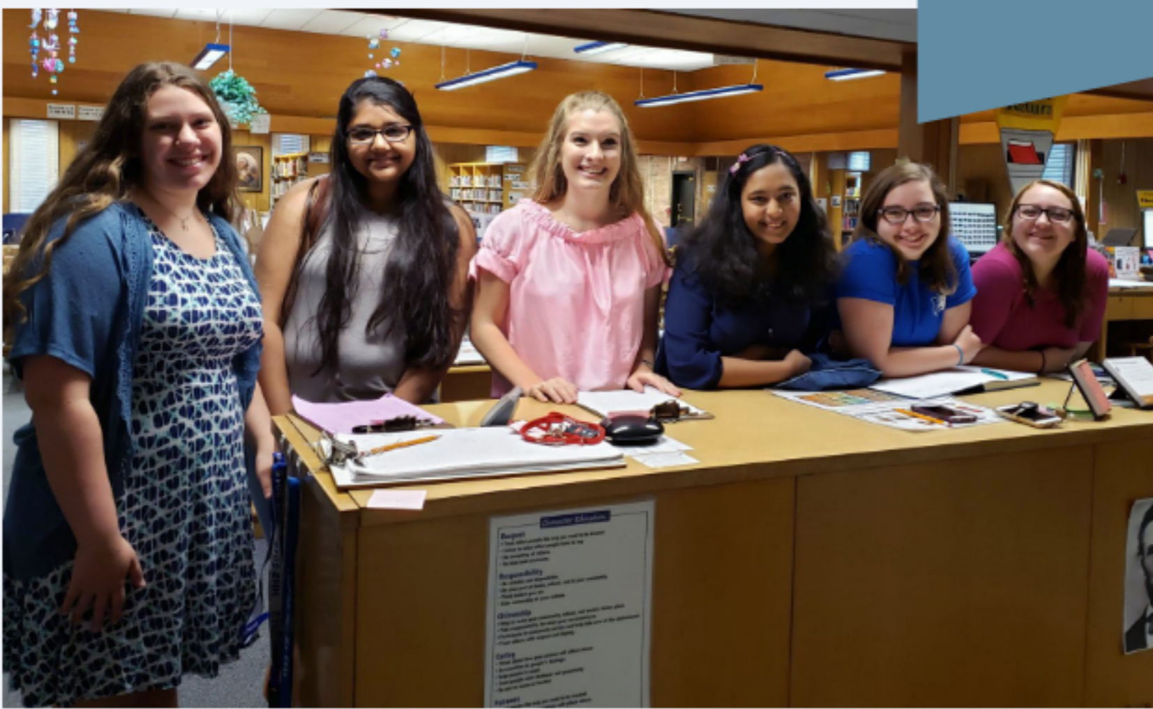
The morning social, every day this year