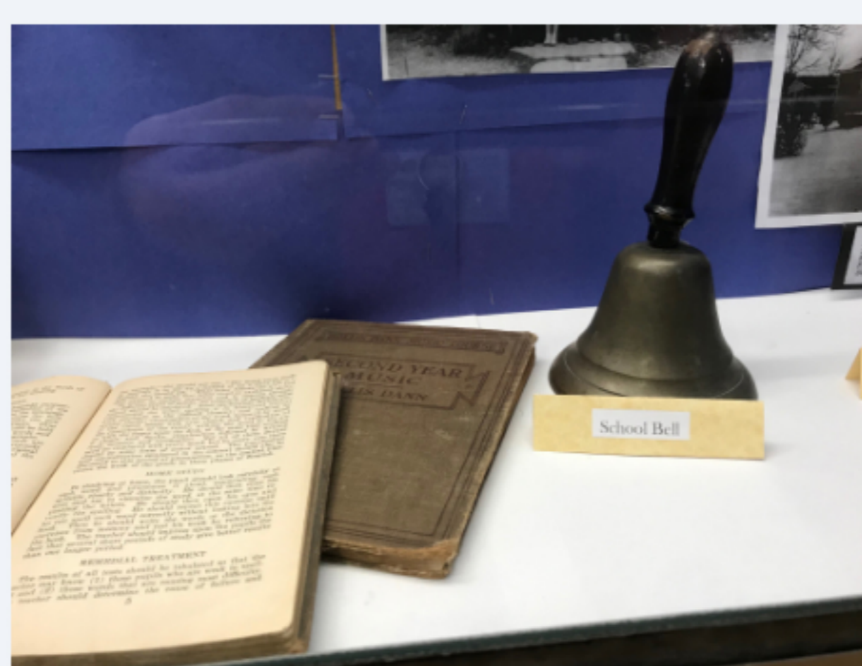
The Horseheads Historical Society lent items from past Horseheads classrooms for a cool display case.