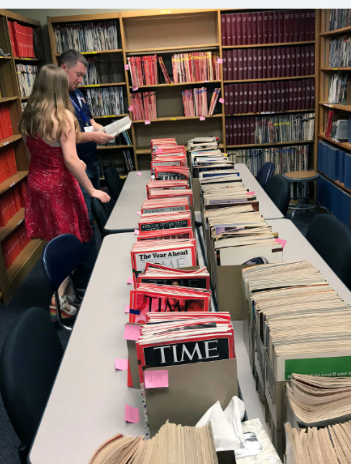
Global II classes made use of the library's archive of Time to make virtual time capsules of the past 25+ years.