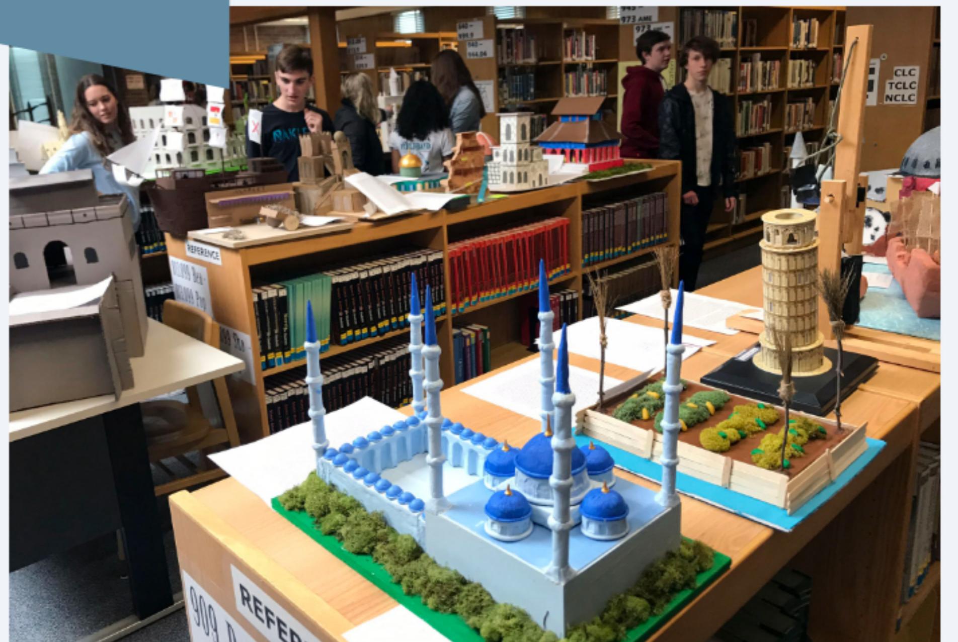
AP World History classes turned the library into a museum with their projects