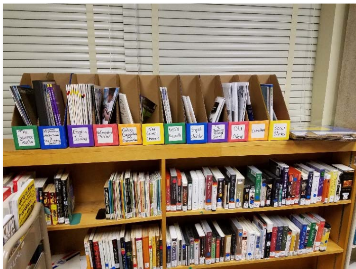
Professional journals for the district teaching staff made their return to the William H. Davis Professional collection this year.