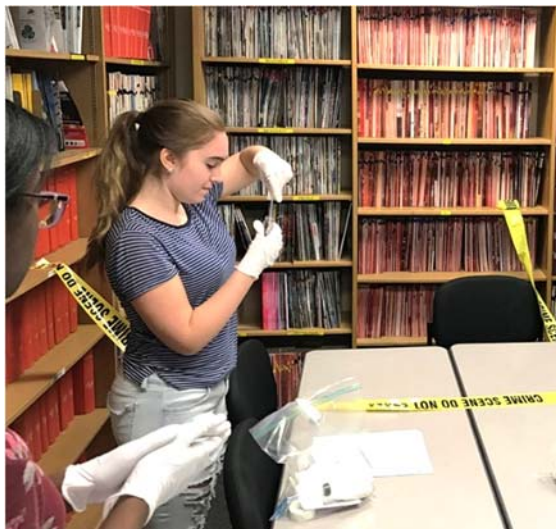
Working a crime scene in the library conference room for the new Forensics class.