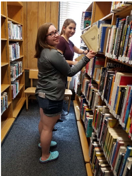
The art of shelving