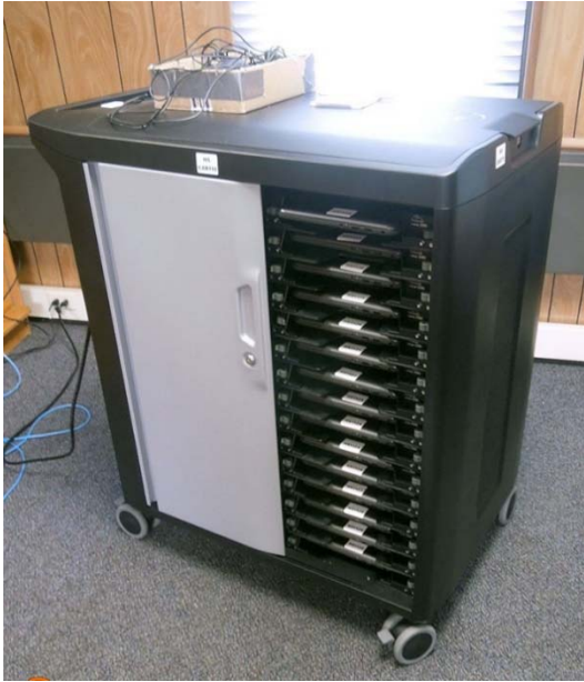
The library received a new mobile cart in the spring, with thirty touchscreen, Windows 10 laptops. It was an instant hit with the students.