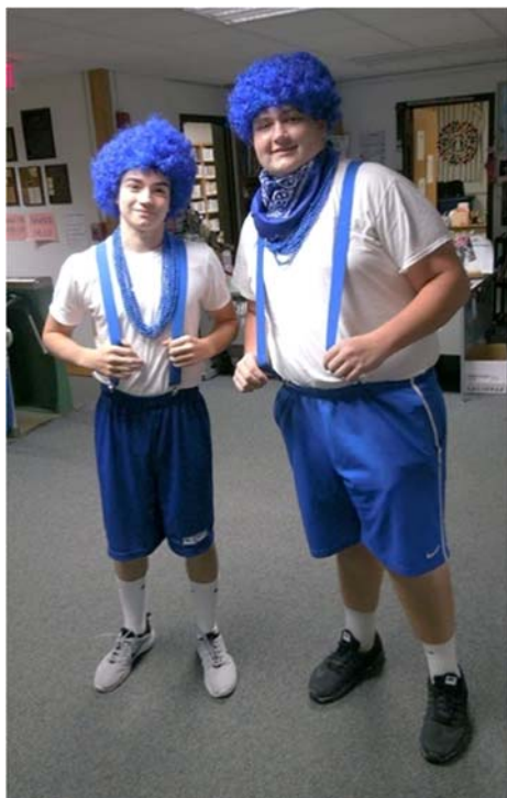
Raider pride and joy

A lot of fun was brought into the library, by students and staff alike.